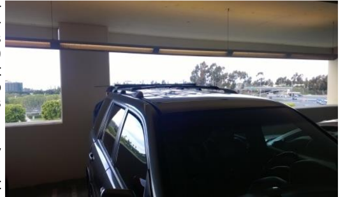
See the T? It was cleverly hidden on top of the SUV.

At that point, I had visions of traversing the mall with my tape measure beam, but thankfully, the hiders, Gray, WA6BJY & Alan were nice enough not to do that! But was it easy? No. Easy to hear, but not easy to find. My 2nd bearing was from a parking lot behind the below building pictured (I used to work in that building when it was the AT&T building years ago). The bearing did not point in the direction of the T, but to the left of the building. Thinking the T could have been in the Great Park, I went across the freeway, but the signal rapidly experienced picket-fencing and got weaker.