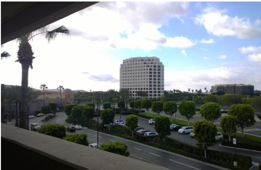
The View from the T. It was a cool, windy day and I was wishing I had my jacket after I got out of my car.

Circling around, I found a spot overlooking the Irvine Spectrum again. The bearing this time pointed directly at a parking structure. Uh oh, that could be fun. (it was). After winding my way up the many levels of the parking structure, I parked at the top and set out on foot. I quickly noticed another T-hunter, Karl, KF6MDF, making the rounds, a good sign that I was in the right place! Well, after a few transmissions we both seemed to decide it probably wasn't on the roof and that wouldn't have been enough fun, right? Why not sandwich the T in the middle of the parking structure somewhere, right? Well, as you can see from the above that's exactly what they did. It probably would have taken us longer to find the T if Karl hadn't heard suspicious laughter as he was investigating some cars. The hiders were trying to conceal their presence, but the close up view of a T-hunter swinging around his antenna was too much for them to bear. I wasn't too far behind Karl and before they could reset and regain their composure, I was on the scene as well. We were rewarded with drinks and goodies for our efforts, but I tried to remind myself that finishing second is almost as good and it means I get to hunt again next month.