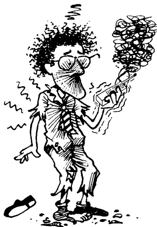
Maybe a 1 kW HT wasn't the great idea Joe thought it would be

DE KFS = THIS IS THE FINAL CW TRANSMISSION FROM STATION KFS - THE LAST COMMERCIAL RADIOTELEGRAPH STATION IN NORTH AMERICA. APPROPRIATELY, WE CLOSE CW AND EMBARK ON A NEW ERA OF COMMUNICATION WITH SAMUEL F.B. MORSE'S WORDS OF 155 YER ? YEARS AGO = NW CL 73 = WHAT HATH GOD WROUGHT = DE KFS