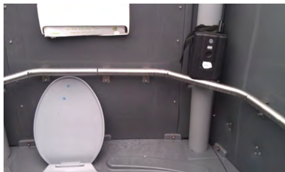
Ham radio - always something new...