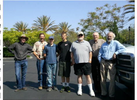
May T-Hunt group

The June T-hunt was held on a nice sunny day -- a good day for a drive. But, why make the hunters drive far when there are interesting locations right in Mission Viejo. The Mission Viejo Youth Athletic Park, located at the corner of Olympiad Road and Melinda Road (just across Olympiad from the entrance to Lake Mission Viejo) is a low area that serves as a basin to catch water in case of very heavy rain. A small stream flows along the edge beside Melinda. There are large drain ducts at the corner with a large metal cage to keep large animals (like humans) out. There are large vertical spaces between the steel bars that should allow a 2m signal escape - with some diffraction and scattering effects to add to the confusion. There is also plenty of dense shrubbery near the cage in which the transmitter could be hidden. Just run the coax over to the cage, with the antenna inside. It should be interesting.