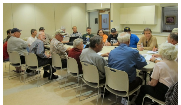
SOARA discusses FD preparations.

We are running a 3A operation and are planning to have a good contest and a lot of fun. Also please remember that Field Day is not only for us radio amateurs but