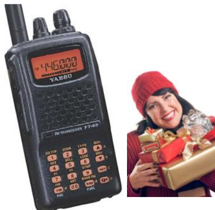
2nd Prize: Yaesu FT-60R