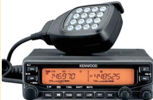
Grand Prize: Kenwood TM-V71A