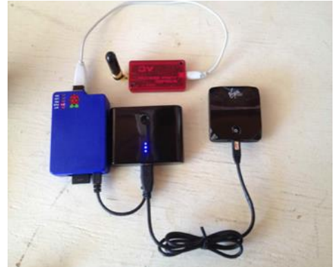
Standalone D-Star operation