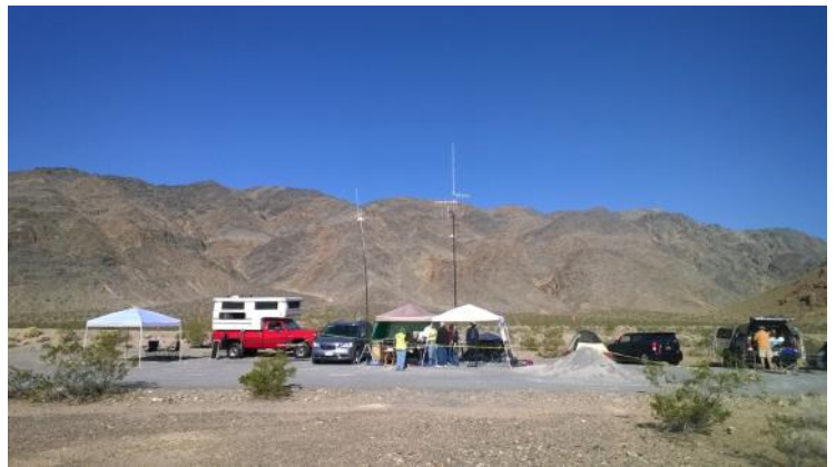
B2V Stage 8 Ham Radio Operations Tents and Antennas