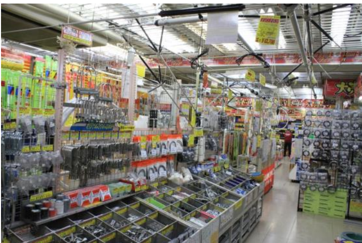
Inside "Rocket" Store

[For a map of Akihabara and for additional (larger) pictures, please visit Tak's website at: http://w6si.com/blog-005.html ]