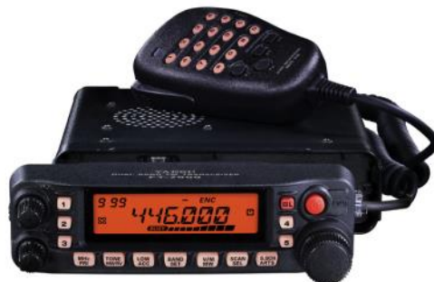
July's Raffle Prize: Yaesu FT-79000R