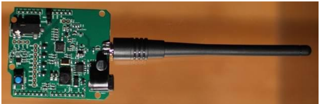
Photo of hamshield that plugs into the Arduino

Arduino information link: https://www.arduino.cc/