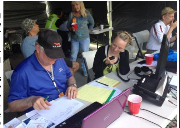
The GOTA station at Gilleran - FD 2015

“Field Day” is the climax of the week long “Amateur Radio Week” sponsored by the ARRL, the national association for Amateur Radio. Using only emergency power supplies, ham operators will construct emergency stations in parks, shopping malls, schools and backyards around the country. Their slogan, “When All Else Fails, Ham Radio Works” is more than just words to the hams as they prove they can send messages in many forms without the use of phone systems, internet or any other infrastructure that can be compromised in a crisis. More than 35,000 amateur radio operators across the country participated in last year’s event.