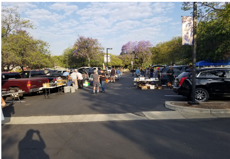
Clairmont - July 2021

The Claremont Amateur Radio Society (CARS) Radio/Electronics Swap meet is held on the third Saturday of each month, except December. 6:00am to 11:00am, at the parking lot of Granite Creek Community Church 1580 N Claremont Blvd, Claremont, CA 91711. There are usually 15 or so vendors selling radios, components and other items. I picked up a AR-22 antenna rotor and control box rebuilt and tested for $40. The next swap meet is November 17.